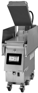
Model XPE12 Shown with straight grease cans